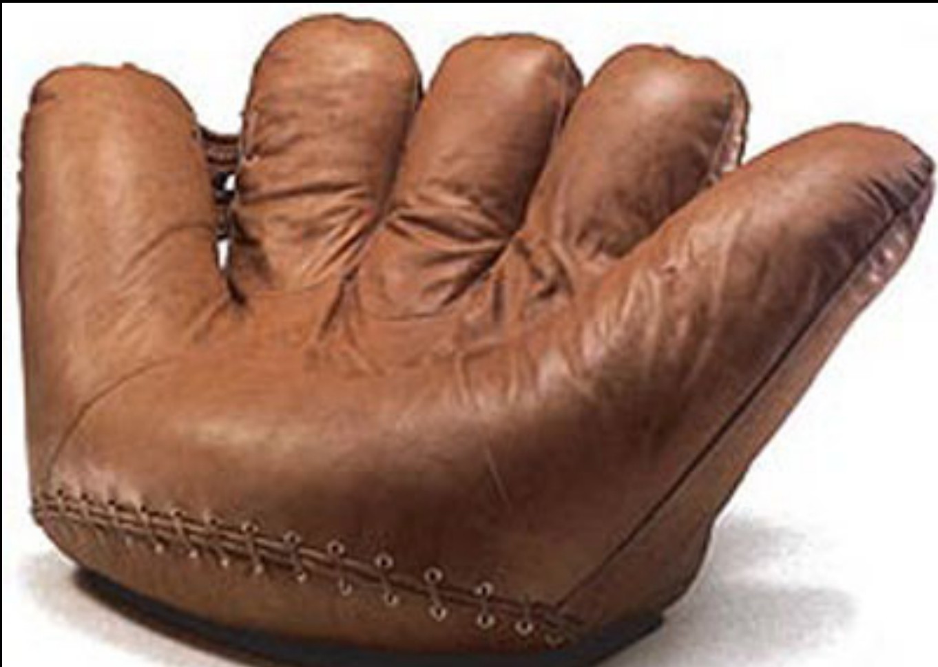
Baseball Glove, soft sculpture